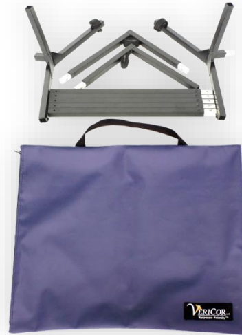
Disassembled Stand w/ Carry Bag

*Upright Medical Organizer sold separately.