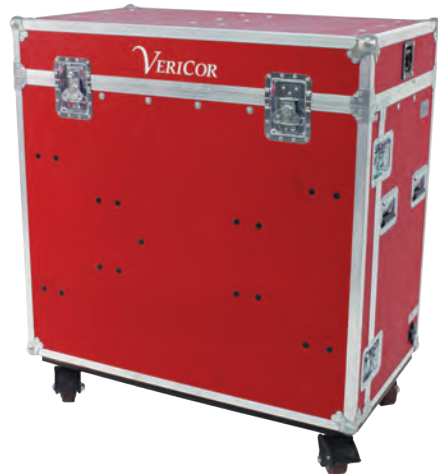
42" Workstation (closed)