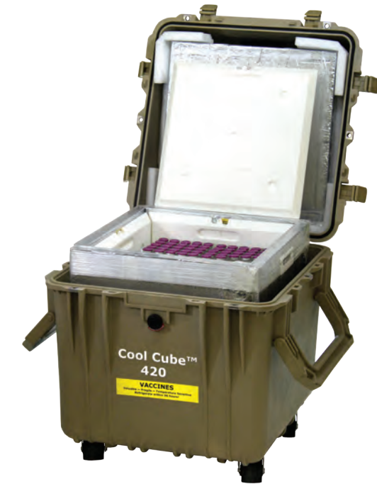
Cool Cube™ 420 106+ hours