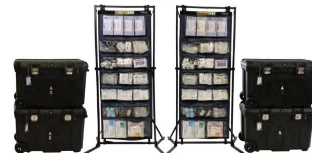
Wound Care - ER