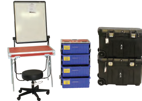
Administrative Support - ER