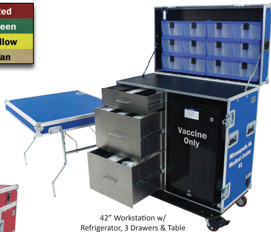
42" Workstation w/ Refrigerator, 3 Drawers & Table